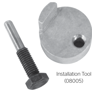
Installation Tool (08005)

Note: Remember, each application is different, so follow the OE manufacturer's guidelines for proper stretch belt installation. As with all V-ribbed belts, proper installation is critical for maximum belt life and drive efficiencies.