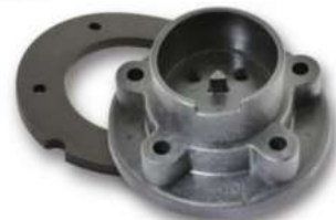
Standard Profile (potted)