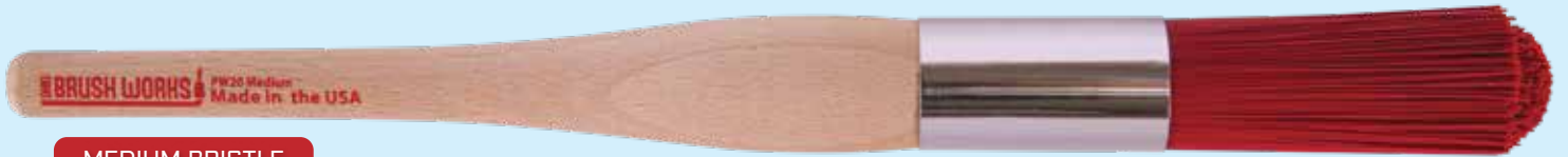
MEDIUM BRISTLE PART# PW20