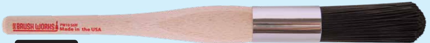
STIFF BRISTLE PART# PW10