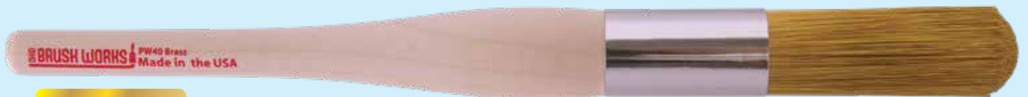
BRASS BRISTLE PART# PW40