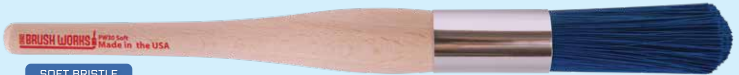
SOFT BRISTLE PART# PW30

Available in Soft, Medium, Stiff and Brass. Also Available in a Soft, Medium and Stiff 3-Pack (Part# PW50).